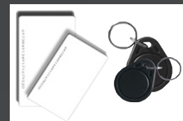
RFID Cards & Tags